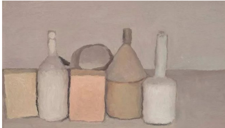
Figure 3: The Still Life series (one)

Zen Buddhism. In the Still Life series, Morandi elevates the subtle layers of gray to new levels, sometimes only implying space but still maintaining its immortal existence. He almost never used bright colors, and every color in his paintings was a gray middle color. Appreciate Morandi's paintings; his colors will captivate you, as illustrated in Figure 3. Morandimo's unique use of color creates a harmonious sense of order in color, while also making him one of the most acclaimed painters of the 20th century.