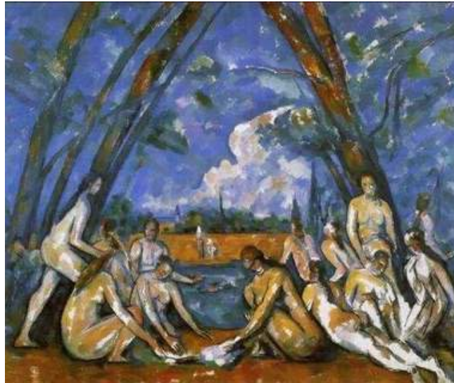
Figure 1: The Big Bath Girl (a representative work by Paul Cezanne)

groups of bathing women look messy, through careful observation, one can find that this is carefully arranged: they are leaning against the trunk, some just got up, some squatting on the ground... although the posture is different, whether in the front, side, or back to the trunk of the body, cleverly balancing the picture, the whole is very harmonious. As shown in Figure 2, through the picture, we can see the geometric arrangement between triangles and circles, which is intended by the painter, in order to make objects and images have a sense of order in space.