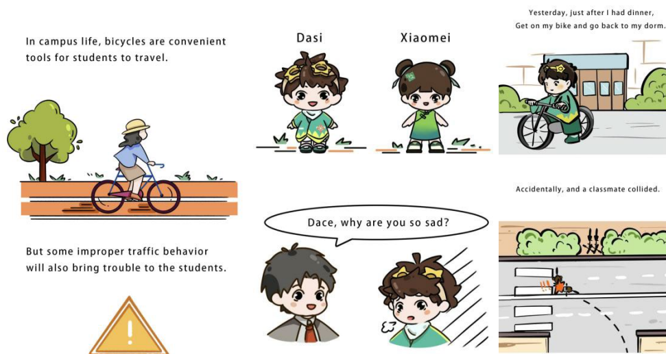
Figure 2: “Traffic Safety” cartoon creation 1-3

In order to improve the effectiveness of popular science comics, in-depth case reproduction and analysis is key. By selecting representative legal cases, the comics can present complex legal concepts and principles to readers in an easy-to-understand manner. The dialogues of the characters illustrate in detail the legal issues and controversies in the cases, helping readers to understand the logic and application of the law. As shown in Figure 2, Figure 3, Figure 4.