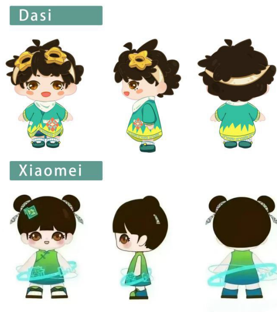
Figure 1: “Dasi”and “Xiaomei” image design (Source: the author drew)