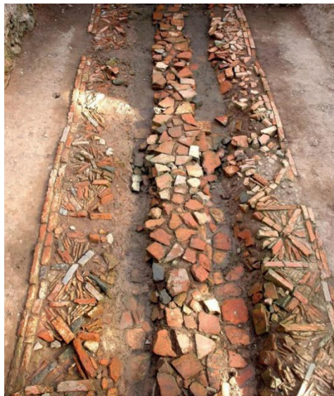
Figure 3: "Lemon flower"-shaped road

In 1999, archaeologists carried out archaeological exploration around Doan Mon, and found the remains of city walls and brick-paved ground in Li Dynasty, especially the brick-paved "lemon flower" road leading to Kinh Thien Palace in Tran Dynasty. This discovery proves that there was once a building at Doan Mon, and the age should be no later than the dynasty of Tran[3].