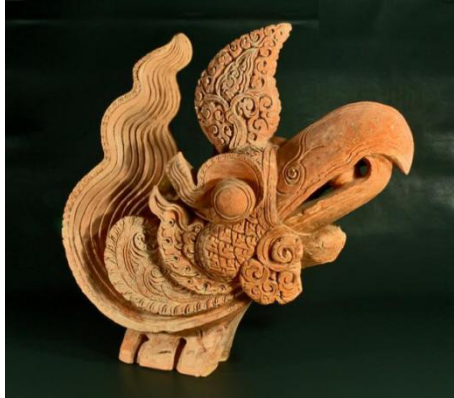
Figure 11: Red pottery phoenix head statue in Ly Dynasty

In addition, a wide variety of building components were found in the site area of No.18 Hoang Dieu Street, such as the statue of a beast with a dragon head and a phoenix head, and the tubular tile, tile and lining tile carved with phoenix-dragon-shaped, lotus-shaped and chrysanthemum-shaped ornamentation. eaves tile and the pottery statues used to decorate the eaves are decorated with dragon and phoenix, mandarin duck, flowers and leaves, which are beautiful and delicate, showing the magnificent appearance of the imperial city that once ascended the dragon.