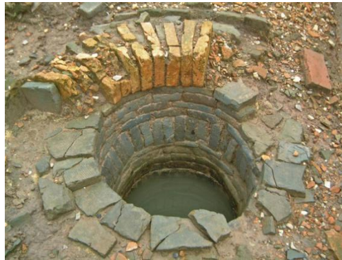
Figure 9: Well (built in Dai La Citadel Period, reused in Ly Dynasty)

In addition to the above architectural remains and relics, many precious cultural relics, such as pottery, building materials and metal objects, have also been unearthed from the Archaeological Site of No. 18 Hoang Dieu Street. There are many kinds of ceramics found on site, including bowls, plates, cans, urns, pots, oil lamps, etc. The most typical ones are white glazed ceramics with thin tyres decorated with embossed dragon patterns (also called transparent white porcelain, the porcelain tyres are as thin as egg shells) and blue flower ceramics with dragon and phoenix patterns. Thin white glazed ceramics can see two pentagonal dragons secretly carved inside the objects through the light. Some porcelain bowls have the word "official" in the middle[7]. Pots, urns, pots, bottles and other utensils are decorated with traditional ornamentation such as water wave lines and rope lines. These ceramics are not only produced in Vietnam, but also imported from China, Japan and West Asia.