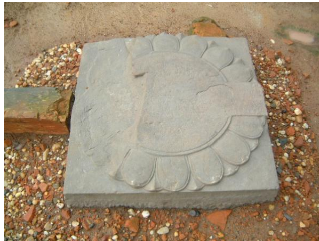
Figure 7: Archaeological Site of No. 18 Hoang Dieu Street

By analyzing the plane of architectural remains in the Ly Dynasty, archaeologists in Vietnam and Japan found a particularly important point: every building in Thang Long Imperial City had been comprehensively planned and designed before it was built, and various types of huge buildings in the excavated area were regularly distributed. In addition to these buildings, archaeologists have discovered many well-built drainage system relics, including small drainage ditches dedicated to single buildings and large drainage channels for large-scale drainage. Well systems in different historical periods are distributed among architectural relics, and 2 wells in Dai La Citadel period, 2 wells in Ly Dynasty, 6 wells in Tran Dynasty and 6 wells in Le Dynasty were excavated. Various pottery pots found at the bottom of the well help us to analyze the service age of the well and the daily life of Thang Long Imperial City.