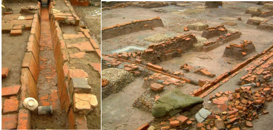
Figure 8: Drainage system of Archaeological Site of No. 18 Hoang Dieu Street