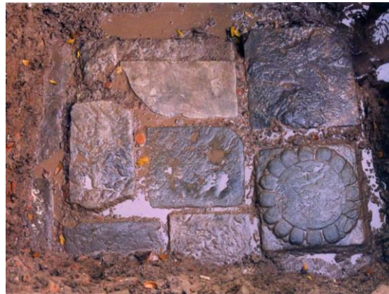
Figure 4: Remains of public pool in Early Le Dynasty.

Archaeological work in 1998 found the remains of the 9th-20th century around the Back Building, mostly in Ly, Tran and Le Dynasties, including the pool built with bricks in the Early Le Dynasty, the lotus pillar foundation with the characteristics of Ly and Tran Dynasties, and the thin white glazed ceramics in the Early Le Dynasty[5].