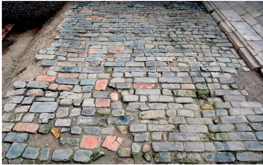
Figure 2: Remains of brick floor at the foot of the wall

two arched doors made of bricks on both sides of the end door. The gatehouse has three floors, and the eaves are bent like knives.