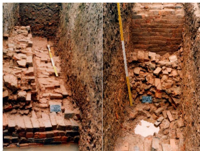
Figure 5: Traces of walls in Le Dynasty.

In 1990, during the archaeological excavations around the North Gate, archaeologists discovered the remains of a wall made of masonry during the Ly Dynasty, with a foundation as thick as 1.2 meters. The remains of another building are 1.66-2.2m deep.