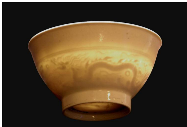
Figure 10: Transparent porcelain bowl in Early Le Dynasty

Metal relics and weapons have also been unearthed from the Archaeological Site of No. 18 Hoang Dieu Street. Among them, there is a cannon from the Ly Dynasty, which weighs more than 100 kilograms and is 1.2 meters long. Nom script are carved on it. Other metal cultural relics are mostly copper coins, labor tools and daily necessities, etc.