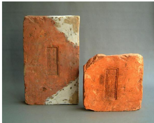
Figure 12: A brick with Ly Dynasty's reign title[8]

Many architectural relics have also been unearthed in the excavation area, such as column foundations, wall bricks, road bricks, floor tiles or pebble foundations, as well as various reliefs, round statues, etc. Among them, tubular tiles and tiles with patterns such as dragons and phoenixes, mandarin ducks and flowers and leaves may be specially used for building the imperial palace. The materials are rich in the characteristics of each era, with characters carved on them, and the bricks of Jiangxi Army were made during the Dai La Citadel period. "Dayueguo Army City" brick is the product of the Dinh and Ly Dynasties. The bricks of Ly Dynasty bear the inscription "Made in the reign of the third emperor of Ly (1057)", and there are other inscription bricks with year numbers. The "Yongning Field" brick produced by Tran Dynasty has lotus pattern, chrysanthemum pattern and peony pattern. In the Early Le Dynasty, there were military titles on the tiles, such as "Zhuangfeng Army", "Wuqi Army" and "Xionghu Army", and some tiles had the inscription "Jinguang Hall" of the palace. In addition, there are green glazed tiles, yellow glazed tiles and tile with embossed dragon pattern.